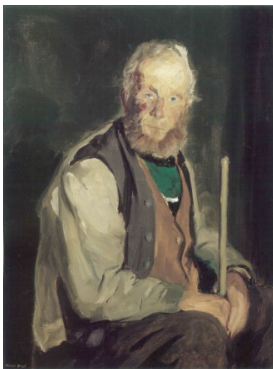
Robert Henri (1865–1921) Himself , 1913; oil on canvas; (32 1/4 x 26 1/8 in.), The Art Institute of Chicago, 1924.907