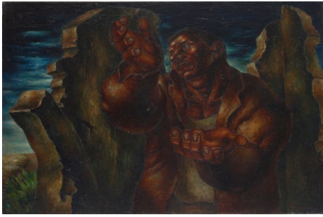
Charles White (1918–1979) This is My Brother , 1942; oil on canvas, (24 x 36 in.), The Art Institute of Chicago, 1999.224