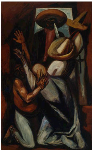
José Clemente Orozco (1883– 1949), Zapata , 1930; oil on canvas, (78 1/4 x 48 1/4 in.), The Art Institute of Chicago, 1941.35 (AIC American Art Teachers Manual)