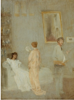
James McNeil Whistler (1834–1903), The Artist in his Studio , 1865/66; oil on paper mounted on panel, (24 3/4 x 18 1/4 in.), The Art Institute of Chicago, 1912.141