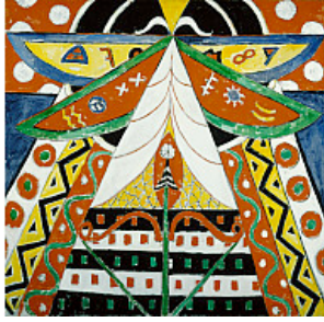
Marsden Hartley (1877–1943) Painting No. 50 , 1914–1915; oil on canvas, (47 x 47 in.), Terra Foundation for American Art, 1999.61