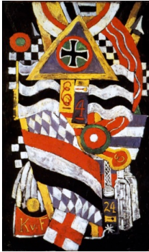
Marsden Hartley (1877–1943) Portrait of a German Officer , 1914; oil on canvas, (68 1/4 x 41 3/8 in.), Metropolitan Museum of Art, NY, 49.70.42