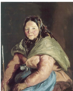
Robert Henri (1865–1921) Herself , 1913; oil on canvas, (32 x 26 in), The Art Institute of Chicago, 1924.912