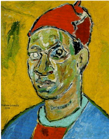
Beauford Delaney, (1901–1979) Self Portrait , 1944; oil on canvas, (27 x 22 in.), The Art Institute of Chicago, 1991.27